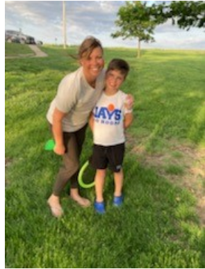
Church school family picnic