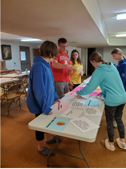
Confirmation Bible review